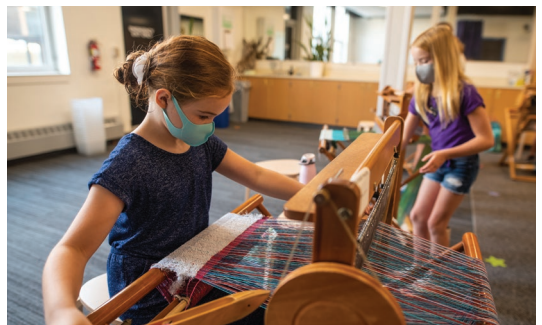
ART & THEATER CAMPS

NEW FOR 2022: CARDBOARD CREATIONS, EVERYTHING MAGICAL, FUSED GLASS, NEXT TOP BLOGGER, PLAYMAKERS' LABORATORY, SOCCER SHOTS, STEAM PARK CAMP AND MUCH MORE!