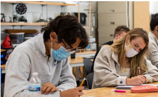
COURSES FOR CREDIT