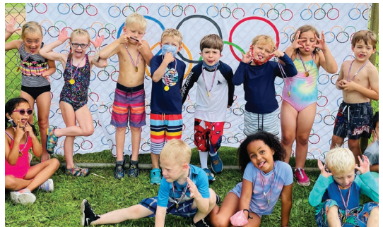
ACOMA DAY CAMP

NEW FOR 2022: CARDBOARD CREATIONS, EVERYTHING MAGICAL, FUSED GLASS, NEXT TOP BLOGGER, PLAYMAKERS' LABORATORY, SOCCER SHOTS, STEAM PARK CAMP AND MUCH MORE!