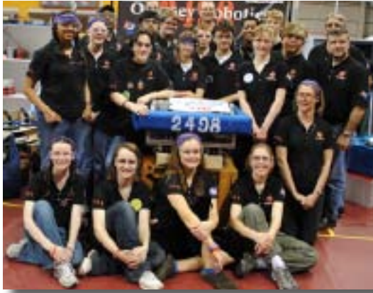
The Blake/Breck Odyssey Robotics team

Blake and Breck high school students joined forces to design and build a robot to compete in the Minnesota North Star Regional Competition sponsored by FIRST Robotics. After three days of fierce and fun competition against more than 60 other teams, our combined team, known as Odyssey Robotics, made it to the quarterfinal round. Odyssey Robotics distinguished itself during the competition as a high-speed, omni-directional robot that was particularly adept at defending two goals in a soccer-like competition called Breakaway. In Breakaway, two alliances of three teams compete on a 27-by-54 foot field with bump-like ramps. Teams remotely move their robots on the field to both score goals and defend two goals.