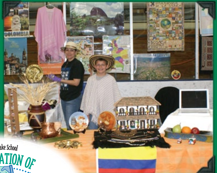
"Columbia: A country of distinct foods and music" was one of this year's 34 Destination Stations.